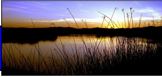
UNIVERSITY OF CALIFORNIA, DAVIS