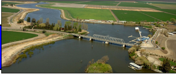
CALIFORNIA DEPARTMENT OF WATER RESOURCES